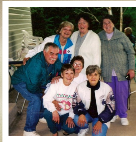
another great family reunion pic!