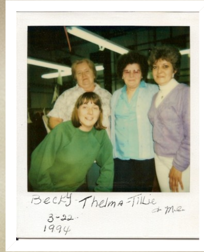
mom and friends from work