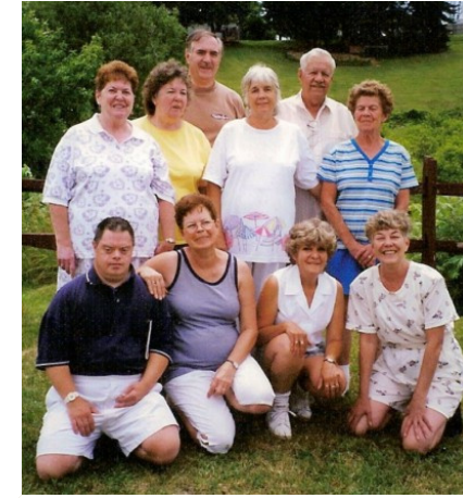
Mom with some of her brothers and sisters