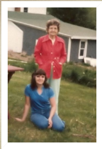
Mom and my gram